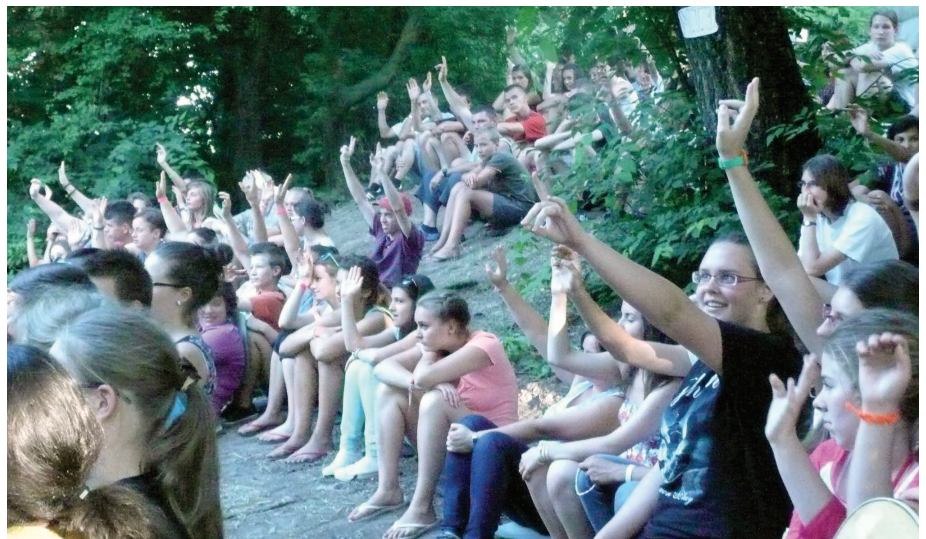
Worship time during one of the five youth camps in the Diocese of Vac in Hungary.