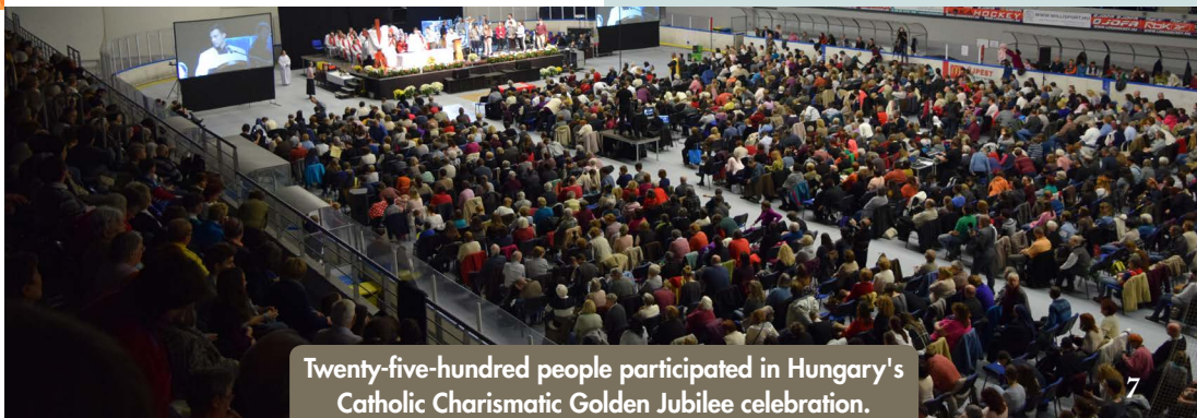
Twenty-five-hundred people participated in Hungary's Catholic Charismatic Golden Jubilee celebration.

During our time with the Renewal Ministries' team, Hungary's Renewal experienced a breakthrough and entered into a new period in many ways. Now we must stop and listen and allow the Spirit to lead us on the next step of this new path.