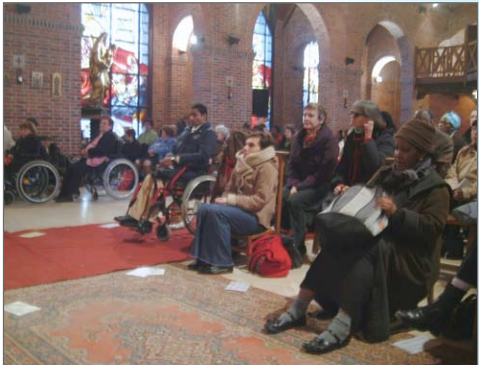
Many sick came to the retreat on the weekend prior to the great feast of Our Lady of Lourdes and the 150th Anniversary of her appearance to Bernadette.

“ But the work of the priests and the sisters is to be available to those enmeshed in pornography and other addictions through teaching, ministry and prayer. ”