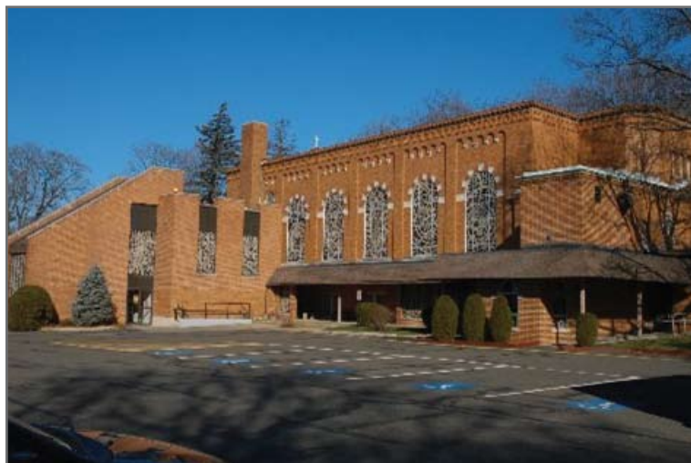
“It was a special joy to do a parish mission at St. Anastasia’s Parish in Teaneck, New Jersey. This is the parish where I grew up and received First Communion and Confirmation.”