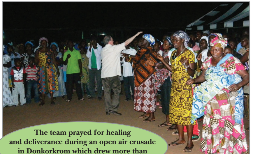
The team prayed for healing and deliverance during an open air crusade in Donkokrom which drew more than 600 people.