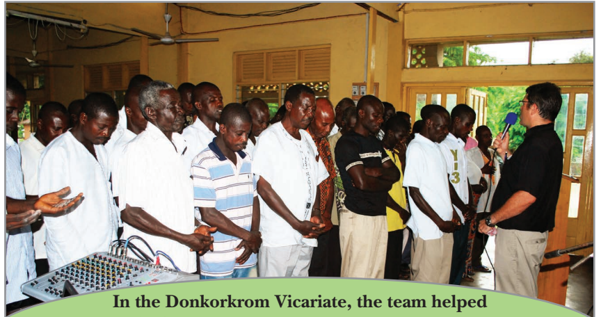
In the Donkokrom Vicariate, the team helped a group of 45 catechists encounter Jesus and experience the power of the Holy Spirit, through teachings, Eucharistic celebrations, faith sharing groups and prayer times.