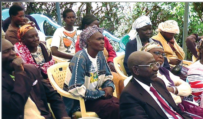
In contrast to the apathy often found in our western civilization, the people of Africa hunger for God's word.