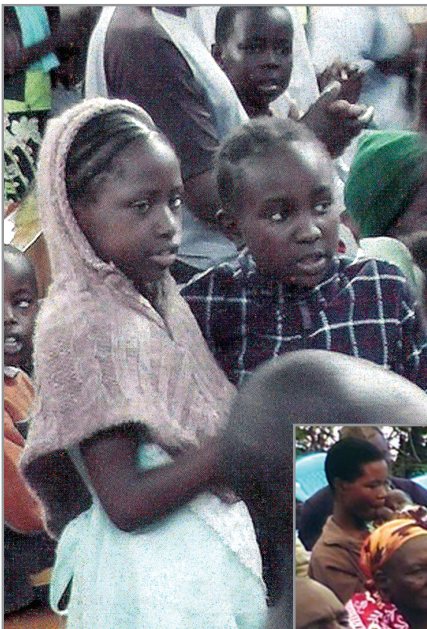
The beautiful people of Kenya.