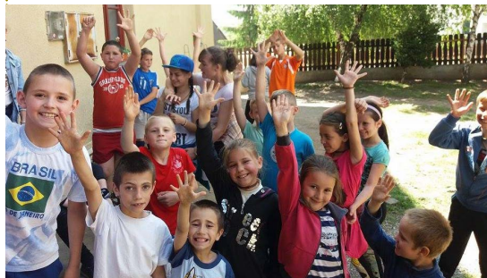
As part of the pilgrimage, we spent some time having fun with kids at an orphanage.

I took a group of young people who had participated in our adventure camps for many years, and who had afterward attended prayer meetings, on a Pentecost pilgrimage. I wanted to help these young people grow closer to each other and inspire them to grow closer to the Lord. We began by celebrating Mass in Csiksomlyo—which is famous for its Pentecost Mass. That place is the spiritual center of Transylvania. Each year, over half a million people attend the Pentecost Mass there, and many come nearly thirty miles on foot. Whole parishes, with their priests, come like this, singing and praying all the way—and all the way home!