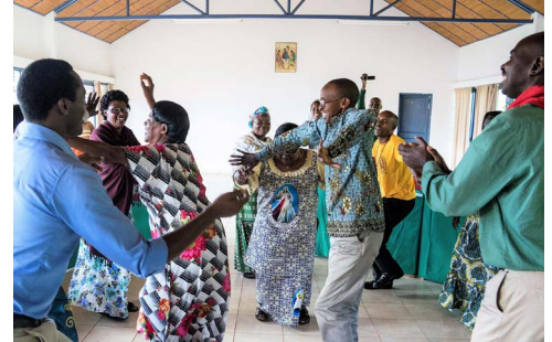
The participants of our training sessions found much freedom in learning the Five Keys.