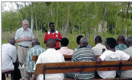
The team preached on many subjects including the differing roles of men and women.