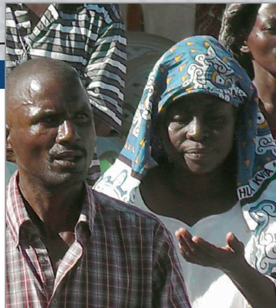
The people of Lunga Lunga responded to the proclamation of the Gospel with open hearts.

Each afternoon we hosted a rally in an open area outside of town. Here we proclaimed the kerygma (the core of the Gospel) to a crowd comprised of