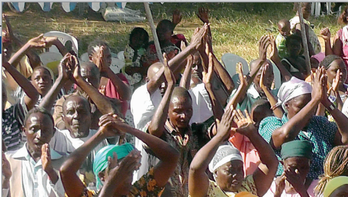
The beautiful people of Kenya made a "joyful noise to the Lord" (Ps 100:1).