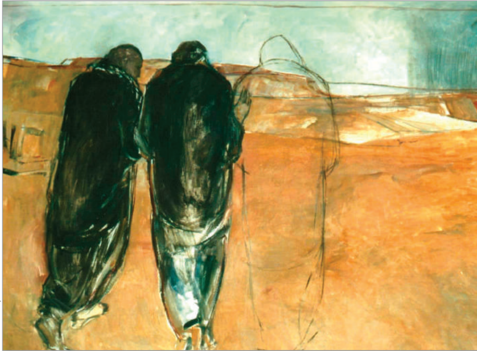
Emmaus by Janet Brooks-Gerloff, 1992.

Before you even begin to read this article, pick up your Bible and read Luke 24:13-35. Read it slowly. Now read it yet again.