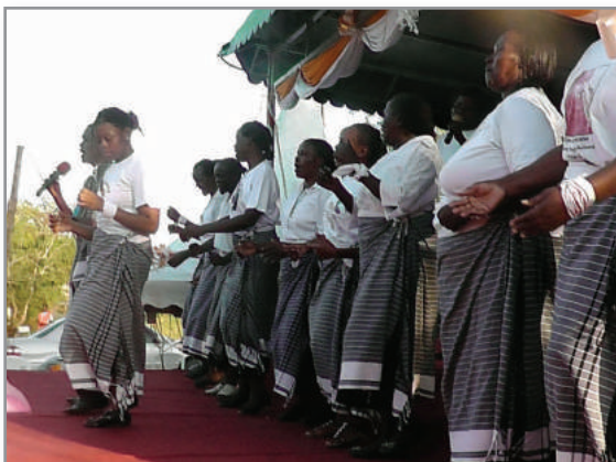
The first ever Catholic rallies in Lunga Lunga drew increasingly more people each afternoon.

We spent our last day at Mary the Mother of God Parish in Embulbul. Approximately 70 parishioners attended two sessions on "Deepening our Catholic Faith." ✠