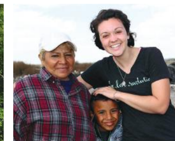
i.d.9:16 Mexico Mission

#id.9:16 intentional disciples 1 corinthians