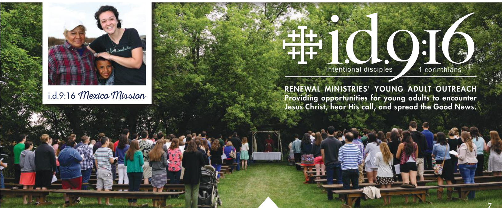
Young adults gather annually for the i.d.9:16 "Barn Party" in Ann Arbor, MI. The event starts with Mass and is followed by dinner & fellowship.

RENEWAL MINISTRIES' YOUNG ADULT OUTREACH Providing opportunities for young adults to encounter Jesus Christ, hear His call, and spread the Good News.