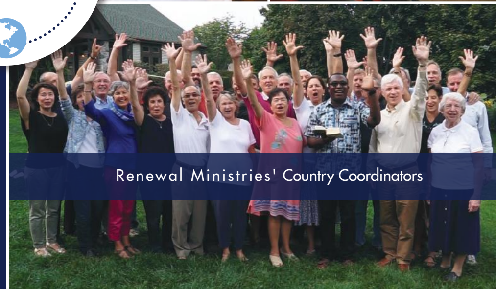
Renewal Ministries' Country Coordinators