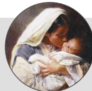
Kissing the Face of God by Morgan Weistling (2015)