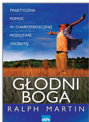
Hungry for God

One of the unexpected delights of the trip was discovering that The Fulfillment of All Desire had been translated and published in Polish. There were 220 copies available at the events where I spoke. All of them were instantly purchased and many more could have been sold if they had been in stock. Also, a new edition of Hungry for God had just been published in Polish. Again, all of the available copies sold out.