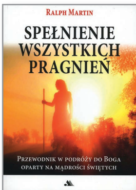
Fulfillment of All Desire

About 300 years ago, this crucifix (above) wept for a period of time and drew many people to a more fervent practice of their faith. In the late 1940s, this icon of Our Lady of Częstochowa (left) wept for a period of time. The communists set up roadblocks to prevent people from reaching the Church in which it was located. But thousands of Poles walked across fields and streams to reach the icon. Thousands of conversions and miracles were reported.