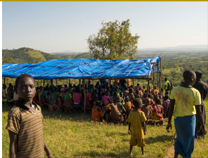
During our time in Gumuz, their "church" consisted of a blue tarp stretched between poles.

When the priest finally said we were close, he pointed at a neighboring mountain with a blue tarp stretched between poles, which was barely visible, and told us that was our destination. We all groaned inwardly. I kept reminding myself that St. Paul had it much worse. When we finally arrived, we were greeted by the whole village. It was quite a sight and made us so glad that we had come. The Gumuz are some of the last of the hunters and gatherers, and by their clothing we could see they were poor. Some of the children had the red hair of malnutrition.