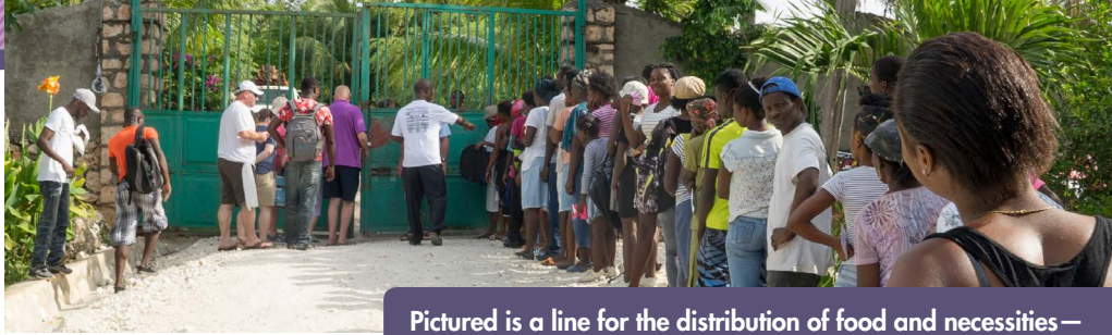
Pictured is a line for the distribution of food and necessities— items like clothing and vitamins that we take for granted.