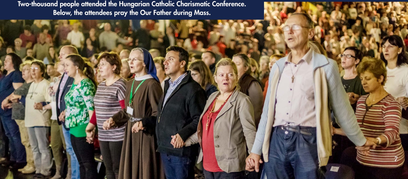
Two-thousand people attended the Hungarian Catholic Charismatic Conference. Below, the attendees pray the Our Father during Mass.

We understood that being a Charismatic leader does not free us from the hardships of life, but that with the Lord, we can overcome everything. Also, his message reminded us that God turns every bad thing to be a benefit for us. Every leader was really thankful for this day together.