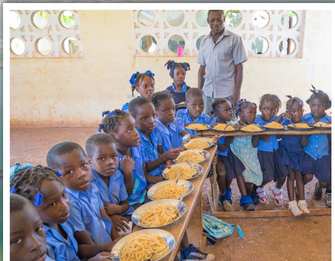
The team spent its first morning serving spaghetti to students.