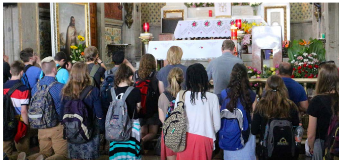
Students praying at the Shrine of Our Lady of Guadalupe.

“The students who go get more deeply evangelized,” she continued. “You see freedom and joy on their faces as they give themselves away for a week. Also, the ability to disconnect from their teenage world—they have to leave their phones at home—is life-changing. It teaches them to communicate face to face with others, to be present and attentive, to listen, to love.”