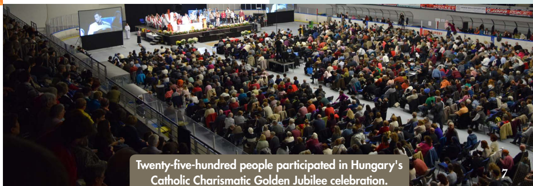
Twenty-five-hundred people participated in Hungary's Catholic Charismatic Golden Jubilee celebration.

During our time with the Renewal Ministries' team, Hungary's Renewal experienced a breakthrough and entered into a new period in many ways. Now we must stop and listen and allow the Spirit to lead us on the next step of this new path.