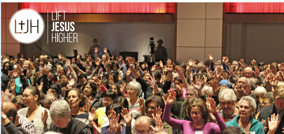
This picture shows just a sampling of the 4500 adults and youth who attended the twenty-sixth annual Lift Jesus Higher Rally in Toronto. It is inspiring to see how beautifully diverse the Church is in Toronto!