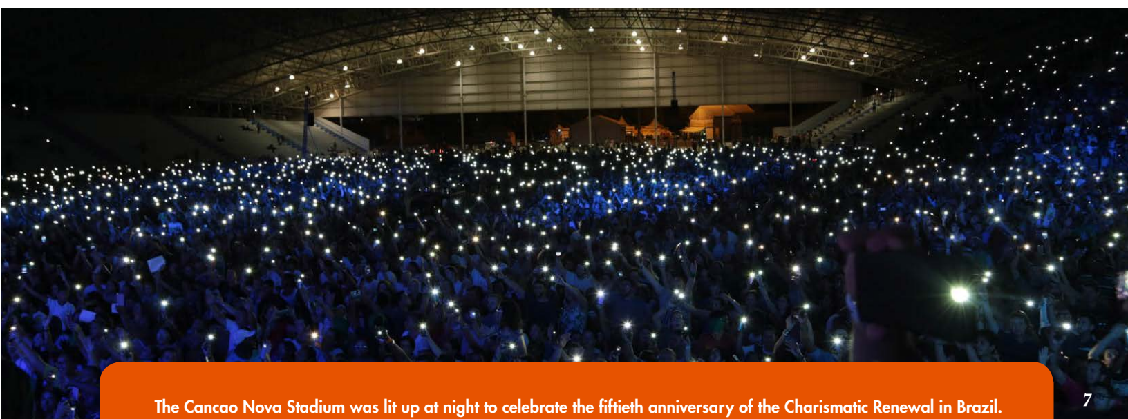
The Cancao Nova Stadium was lit up at night to celebrate the fiftieth anniversary of the Charismatic Renewal in Brazil.