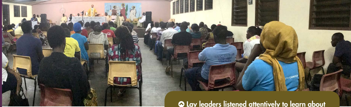
🕒 Lay leaders listened attentively to learn about the Five Keys of Unbound ministry.