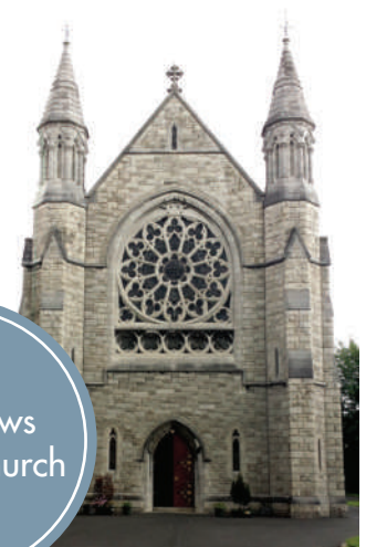
All Hallows College Church

As the "tsunami of secularism," to use Cardinal Wuerl's words, has eroded the faith of the Irish, many priests and bishops have become somewhat timid and selective in preaching the fullness of Gospel truth – particularly on the issues of marriage and sexuality that provoke such hostility from the post-Christian culture. I am grateful that God has called me to help encourage and strengthen priests with confidence in the truth of our faith and joy in preaching it, even in the midst of opposition.