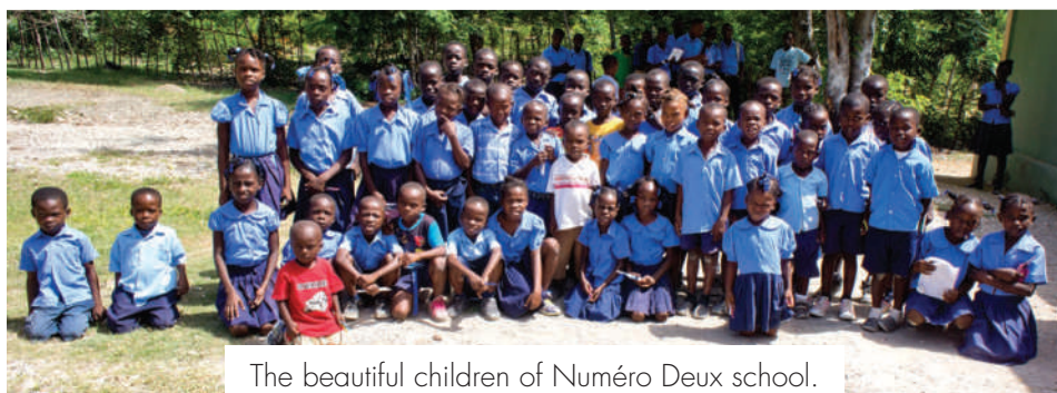
The beautiful children of Numéro Deux school.

It is easy to see the Face of the Lord in the beautiful people of Haiti and experience an irresistible desire to help them. †