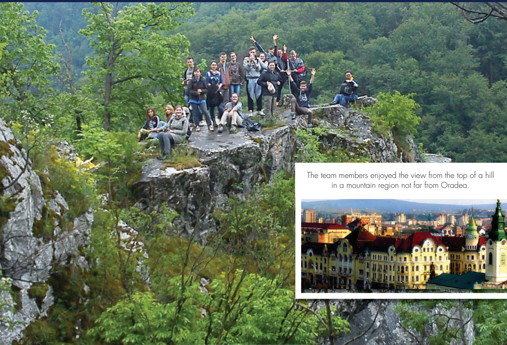
The team members enjoyed the view from the top of a hill in a mountain region not far from Oradea.

In addition to achieving the mission objectives, my young team members grew in their faith. Here are some of their testimonies: