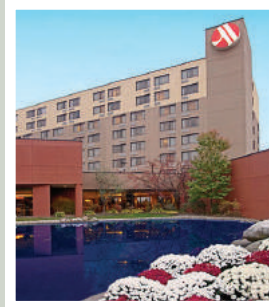
Ann Arbor-Ypsilanti Marriott at Eagle Crest

forming young adults into INTENTIONAL DISCIPLES of Jesus Christ.