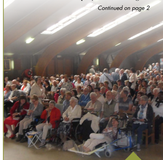
Ralph recently spoke in Belgium for the CCR's Golden Jubilee. The Catholic Church is facing great decline in Belgium.