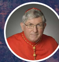
CARDINAL THOMAS COLLINS