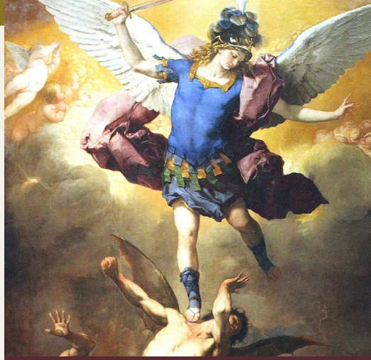
ST. MICHAEL THE ARCHANGEL, Defend Us in Battle

His concerns are shared by some of his colleagues, emails and interviews show, indicating growing frustration and pessimism within the ranks of the health department as the window for controlling New York City's monkeypox epidemic—the largest such outbreak in the United States—quickly closes. 7