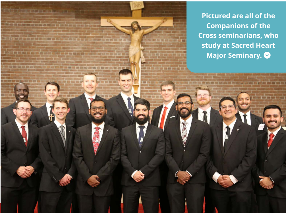
Pictured are all of the Companions of the Cross seminarians, who study at Sacred Heart Major Seminary. 📍

Speaking of SHMS, the Companions now send all their seminarians to our seminary, where I have the joy of teaching them during the year before they are ordained priests. They are a good bunch to be sure!