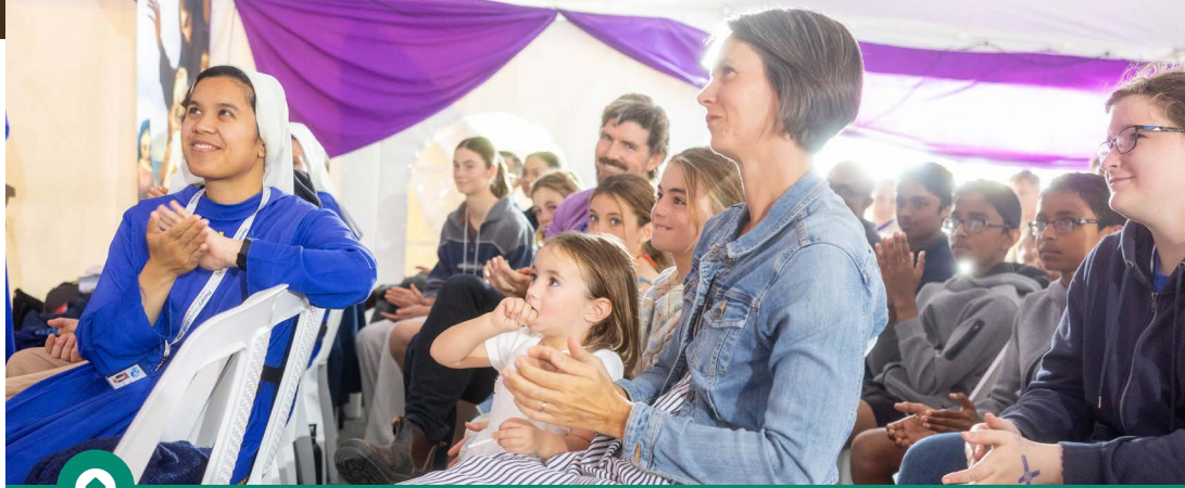
Members of the Immaculata Community and lay people of all ages gathered for the annual Immaculata Mission School in Armidale, Australia.