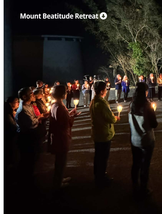
Mount Beatitude Retreat 📍